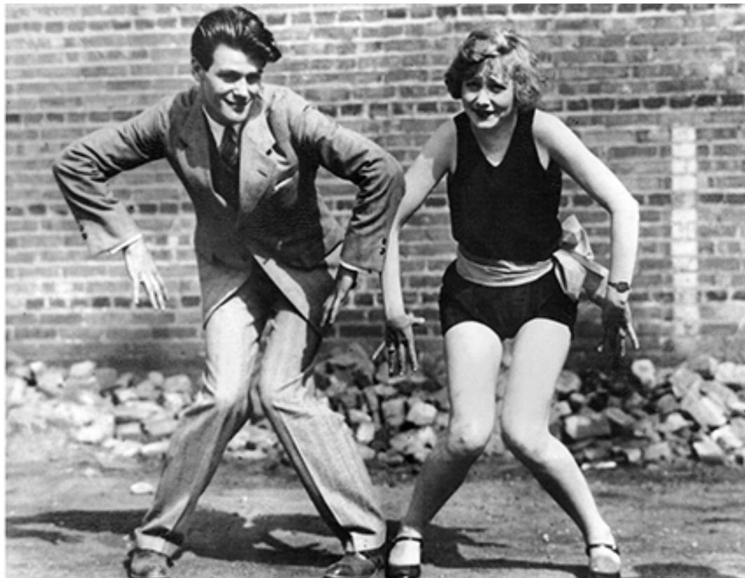
Two people dancing the "Charleston".

Home » Santa Clarita Latest News » SCVi Students To Participate In Roaring 1920's Performance