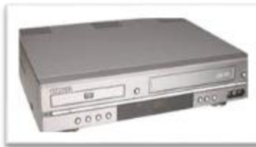
DVD Players, VHS Players & Stereos