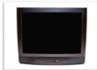
CRT Televisions & Monitors