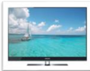
LCD Monitors & Televisions