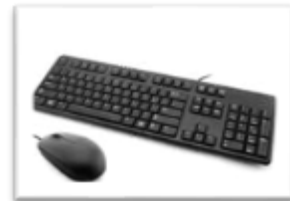
Keyboards & Mice