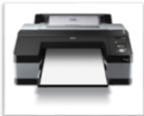
Printers and Scanners