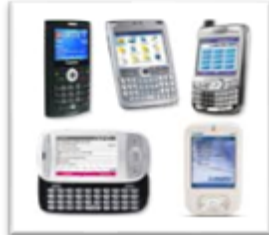
Smartphones & Cell Phones